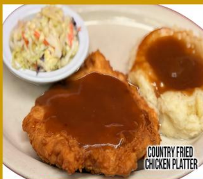
COUNTRY FRIED CHICKEN PLATTER

SERVED FRIDAY STARTING AT 4 PM, ALL DAY SAT & SUN