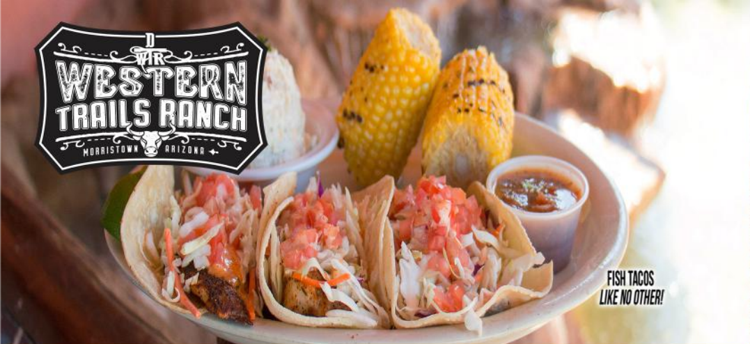
FISH TACOS LIKE NO OTHER!